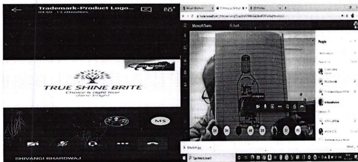
Pic: Trademark & Logo Design in progress.

Internal Quality Assessment Cell (IQAC) Tecnia Institute of Advanced Studies New Delhi-110085