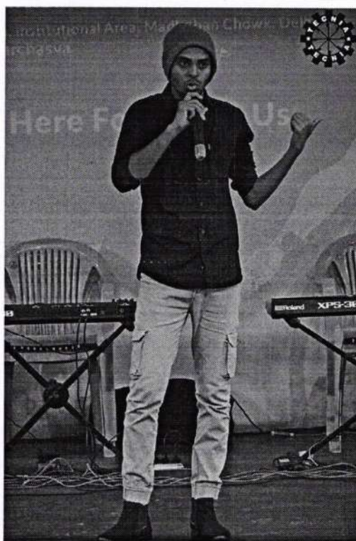
One of the performer performing Act