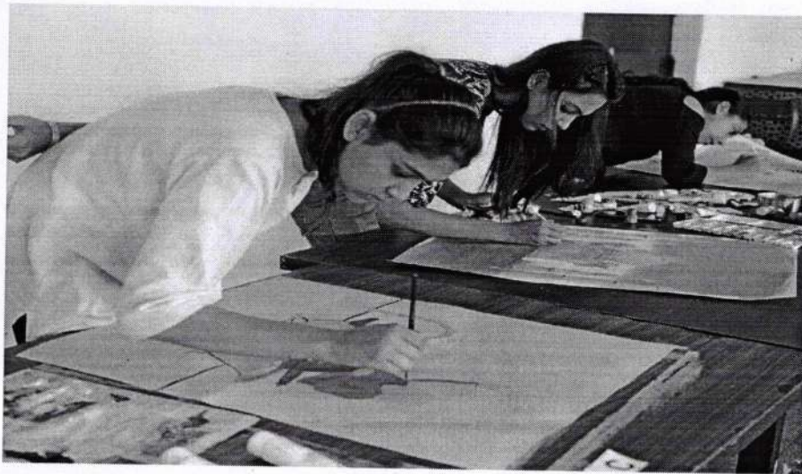
Students while making the posters

The Tecnia Institute of Advanced Studies organized a Poster Making Competition on 2 nd September, 2019, inviting students from various departments to showcase their artistic skills and creativity. The competition aimed to encourage students to express their thoughts and ideas visually, addressing important themes and topics through the medium of art. The theme for the competition was "Digital India", which allowed participants to explore and interpret the topic in their unique ways. The theme was chosen to inspire students to think critically about contemporary issues and express their perspectives artistically. The judges carefully evaluated each poster, providing constructive feedback to the participants. The Poster Making Competition at Tecnia Institute of Advanced Studies was a successful event that highlighted the artistic talents and creative thinking of the students. It provided a platform for students to engage with important social and environmental issues through art, fostering both awareness and expression within the campus community.