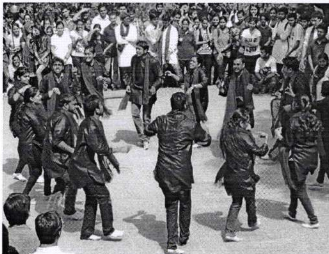
Students spreading the awareness during their performance

Coordinator Internal Quality Assessment Cell (IQAC) Tecnia Institute of Advanced Studies New Delhi-110085