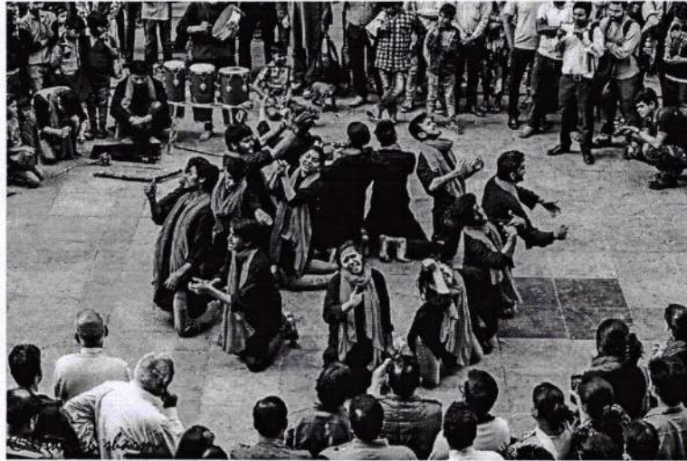
Students catching the attention from their extra-ordinary expressions