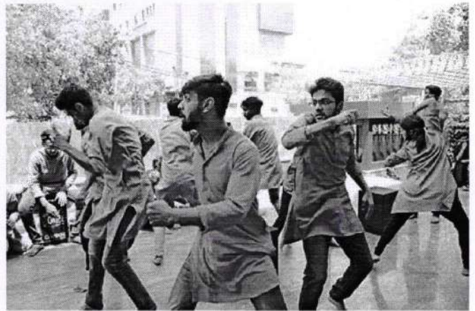
Nukkad Natak performance