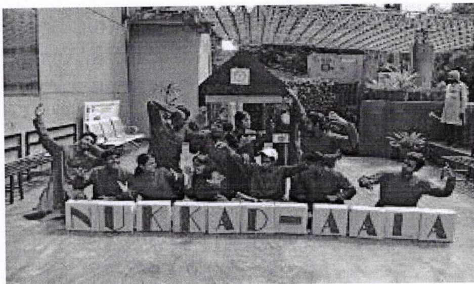
Performance of Mridang on "The Common Man's Struggle Against Daily Injustices"