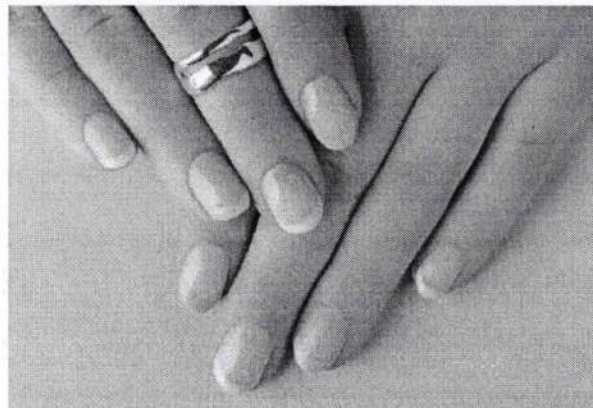
Nail Art done during the workshop