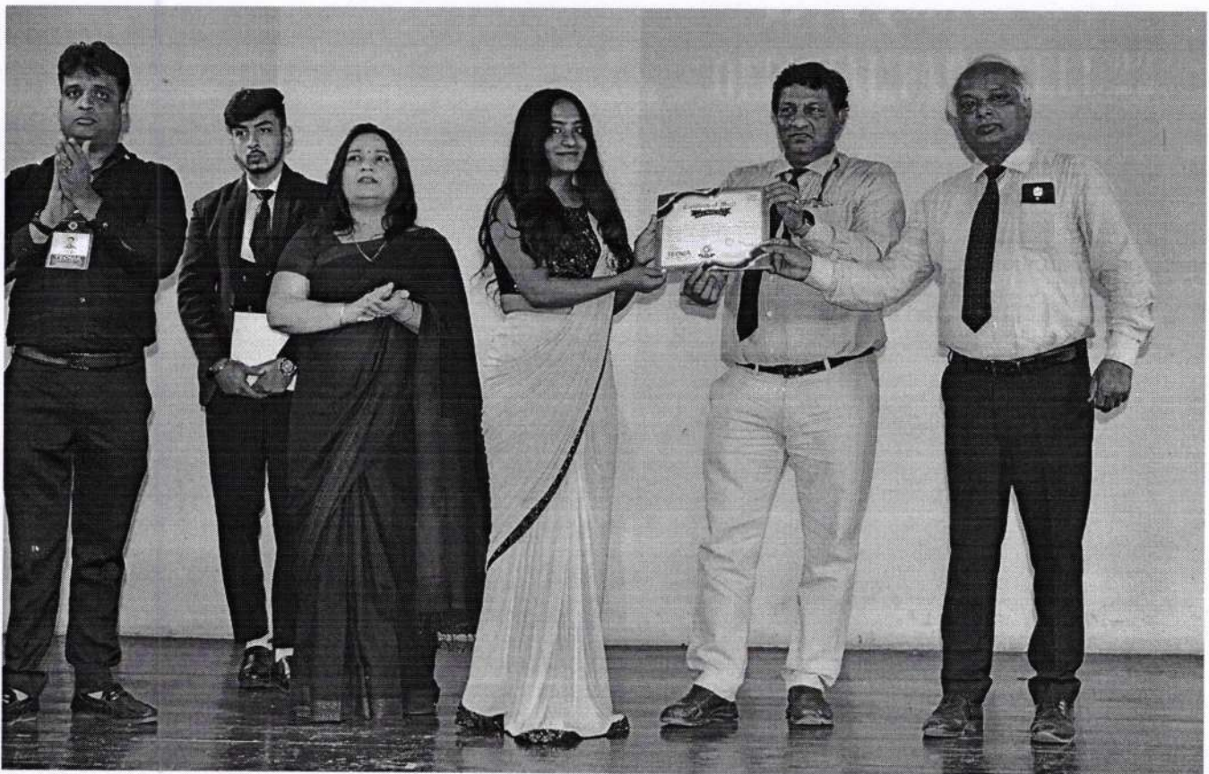
Felicitation of students by Dean (Academics) and Director, TIAS

[Signature] Coordinator Internal Quality Assessment Cell (IQAC) Tecnia Institute of Advanced Studies New Delhi-110085