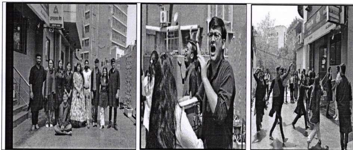
Students during their performance on Animal Cruelty