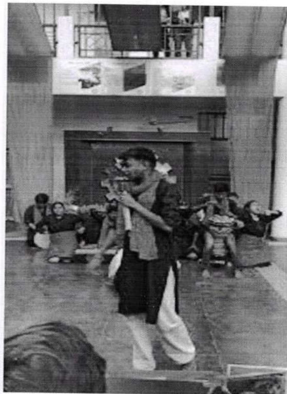
Student performed drama