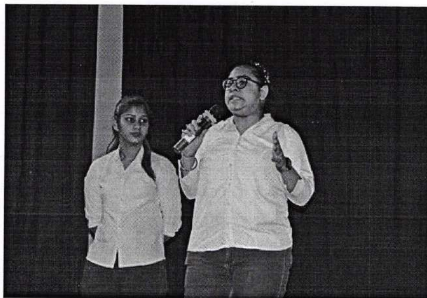
Students narrating about the RTE Act