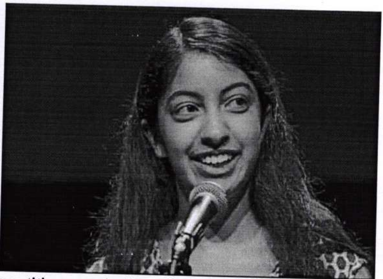
Participants in poetry competition organized in 30 th Nov 2021