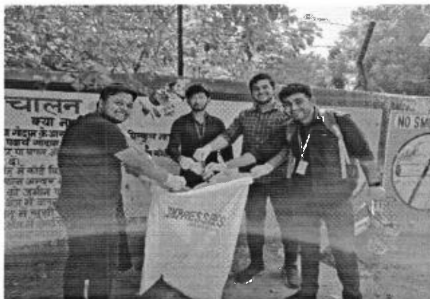
NSS Volunteers are collecting garbage from road