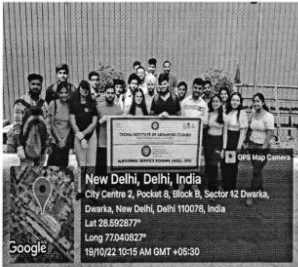
NSS Volunteers actively participated in Clean India Drive