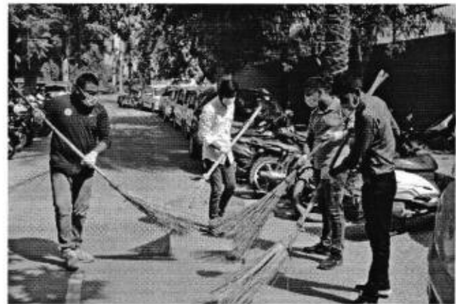
NSS Volunteers contribute to the success of the Clean India Drive.