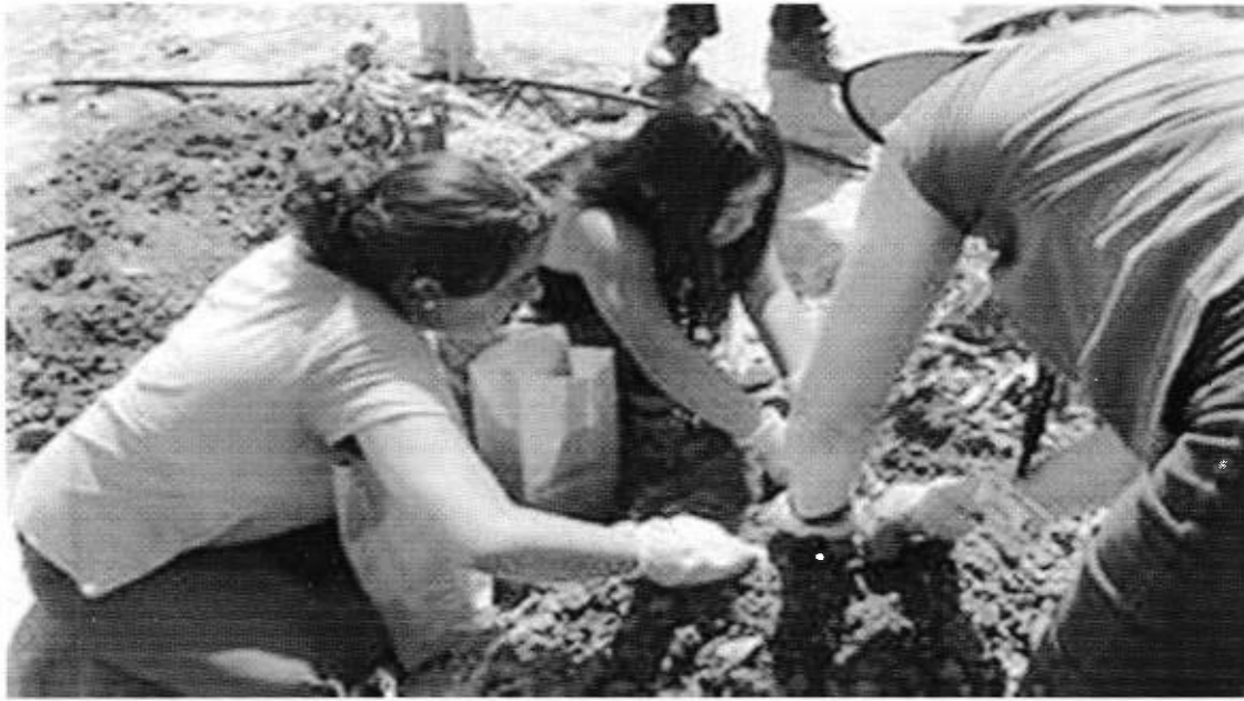
Nature's Cure: Growing Medicinal Plants for a Greener, Healthier Tomorrow