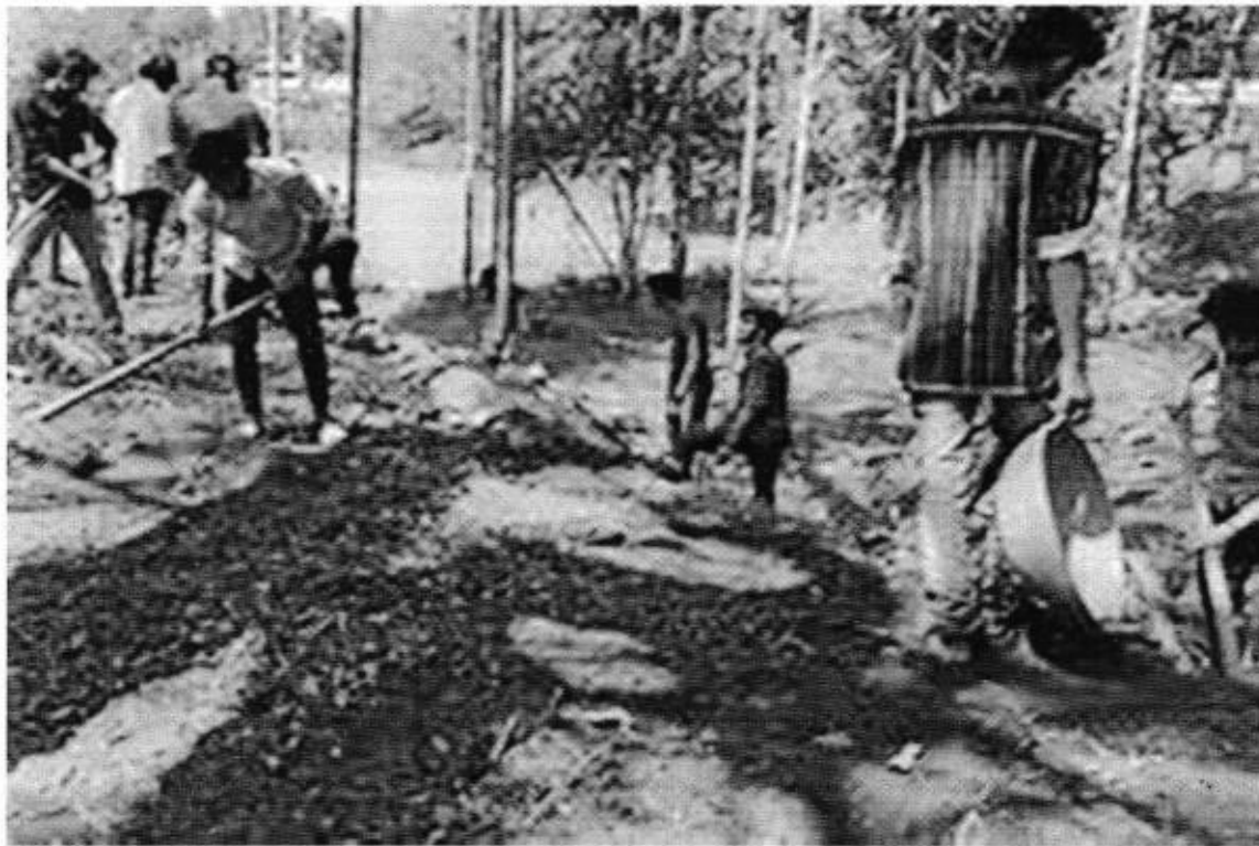
Healing the Planet and Ourselves: Sustainable Solutions Through Medicinal Plants

Coordinator Internal Quality Assessment Cell (IQAC) Tecnia Institute of Advanced Studies New Delhi-110085