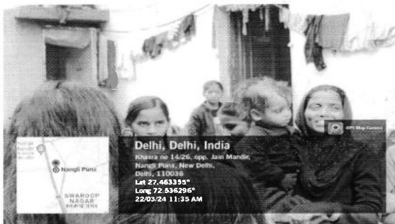
Students interaction with remote women