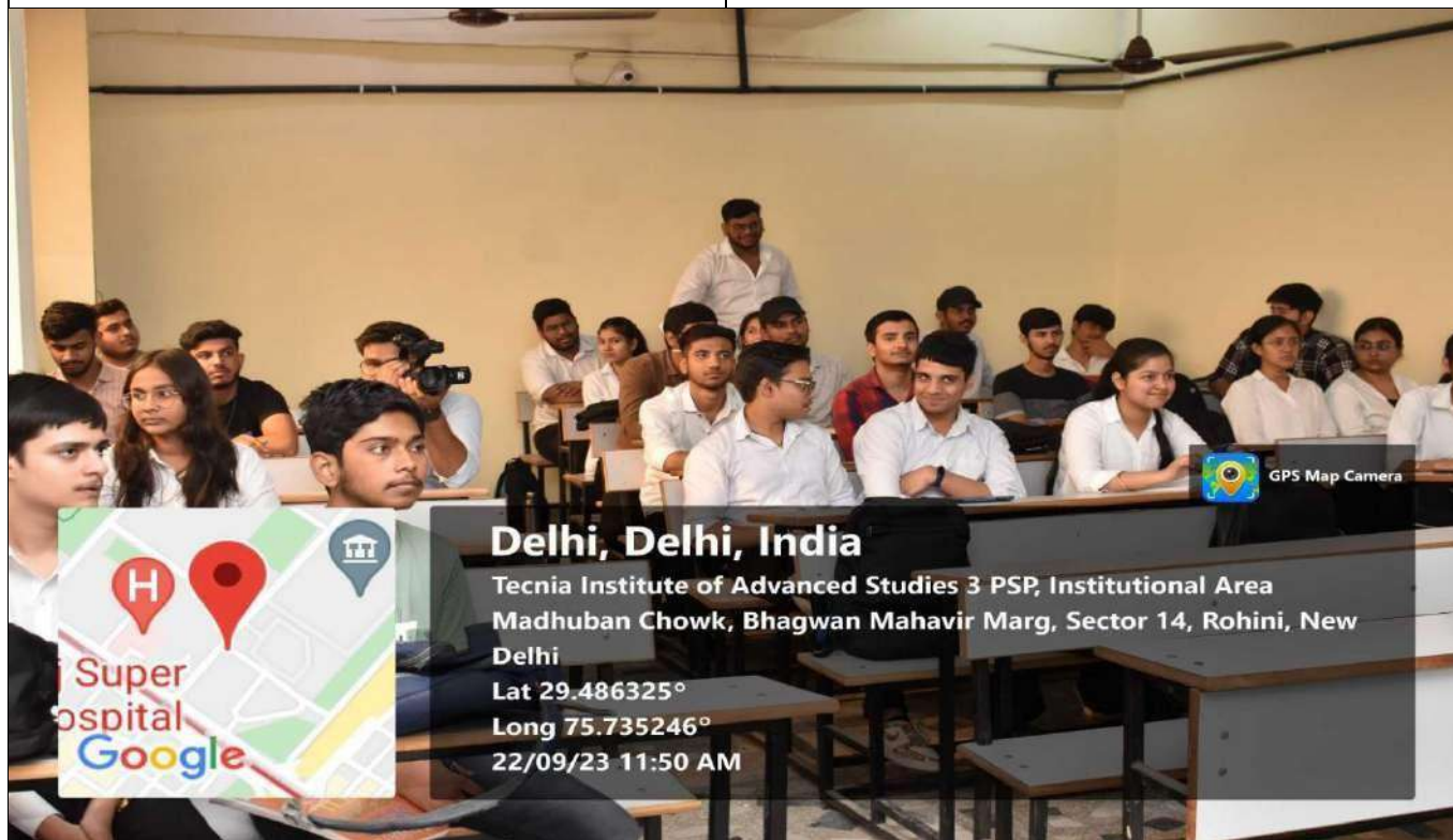
Students Participating in the workshop

Handwritten signature Nodal Teacher Gender Champion Club Tecnia Institute of Advanced Studies Madhuban Chowk, Rohini, Delhi-85