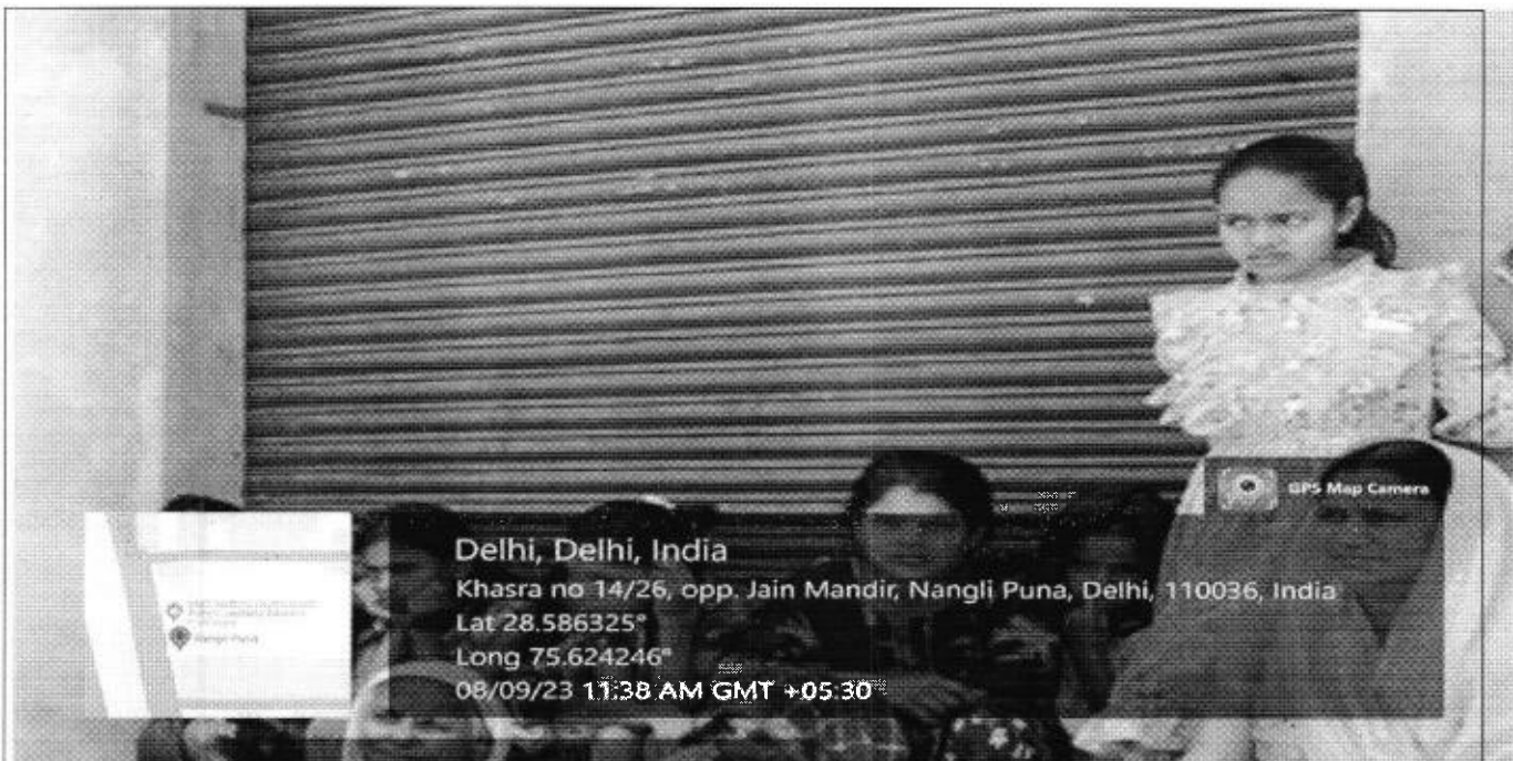
Students make community members aware about their rights