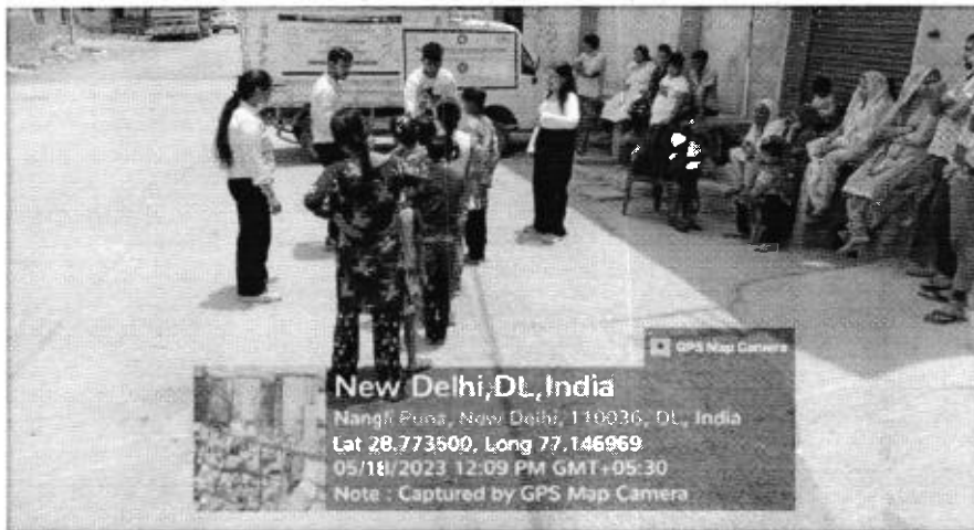
Participants practicing defensive stances and quick movements during a hands-on drill