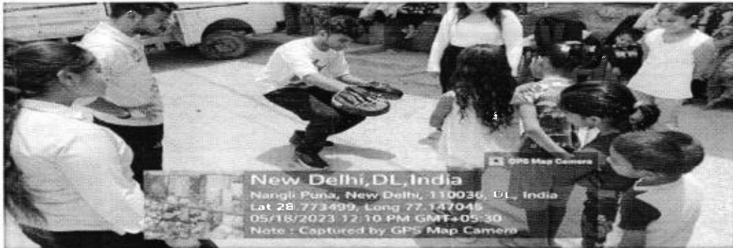
The instructor demonstrated a self-defense technique to participants