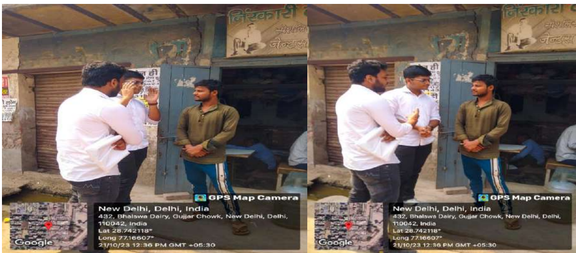
Awaring people in the shops, stalls and all.