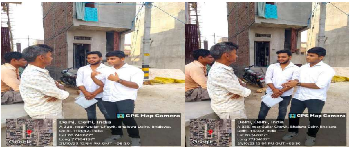
Aware people about techniques for relaxing stress.

Happiness Evangelist: Happiness Club Tecnia Institute of Advanced Studies Madhuban Chowk, Rohini, Delhi-05