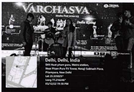
BJMC students performance