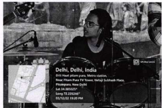
Participants performing with drums