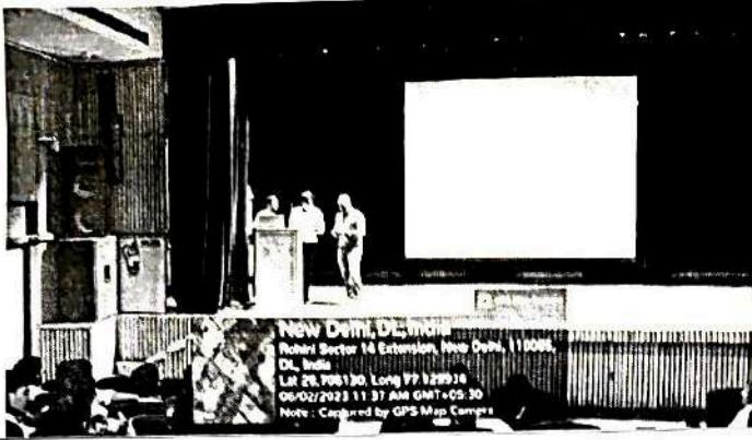
Demonstration by Resource person