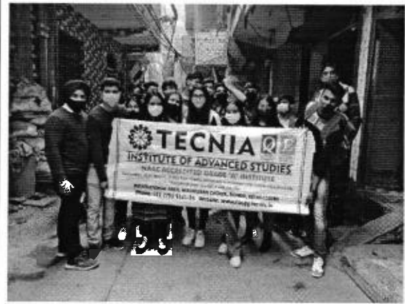
Student's Photograph with Razapur Peoples