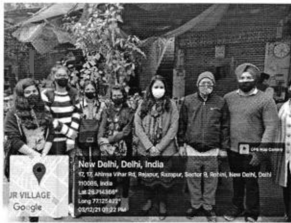
Spreading Awareness About Equality For Health