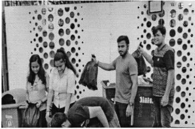
Active Participation of Students