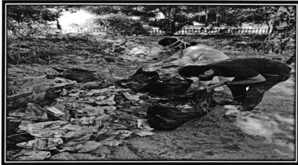
Active Participation of Students