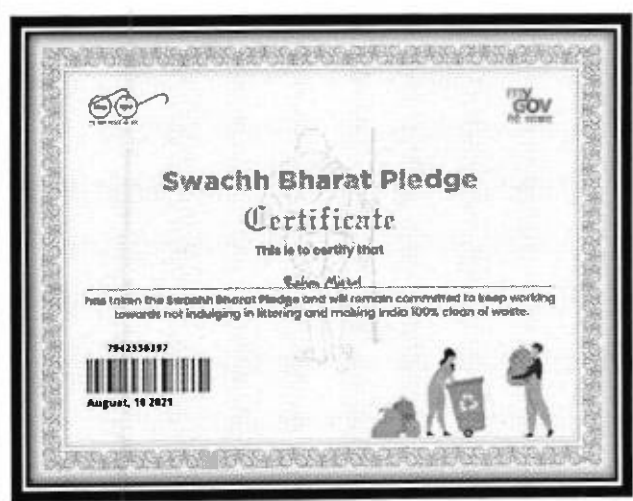
Certificate Given By MyGov

Photograph of the Event with the Caption