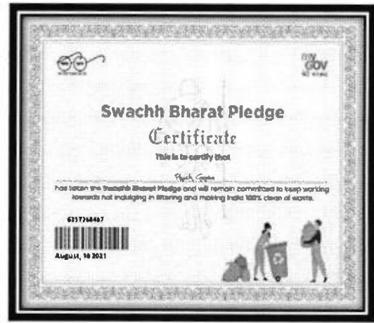
Certificate Given By MyGov