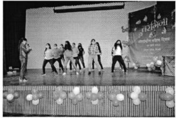
Self Defense Techniques Learned by TIAS Students