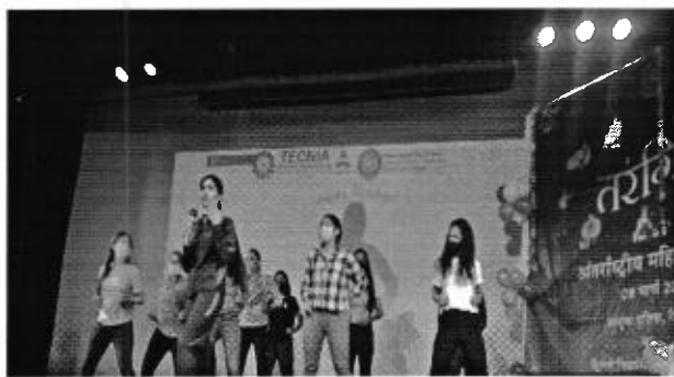
Students are motivated by Trainer