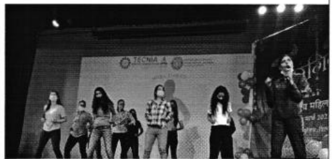
Students are motivated by Trainer