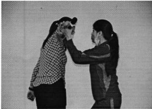
Trainer explains Self Defense Techniques