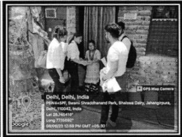
Distributing the Books and Stationary Kits to the Higher Secondary Level Students.

Report: Description in (min 250 to max 800 words)*