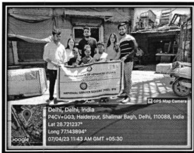
Volunteers leading a community outreach program