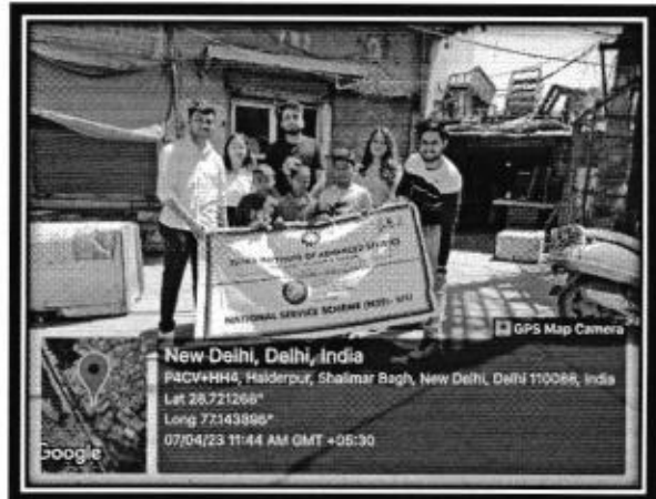
Volunteers of NSS doing Community engagement and social welfare