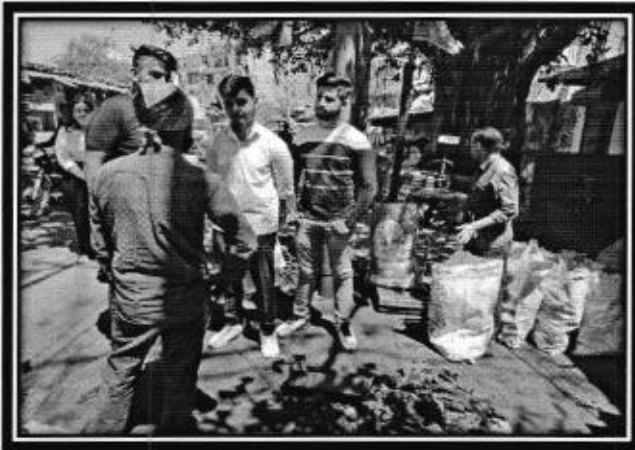
Volunteers of NSS promoting importance of health among workers