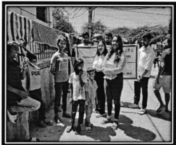
Raising awareness and provide support for the well-being of underprivileged sections