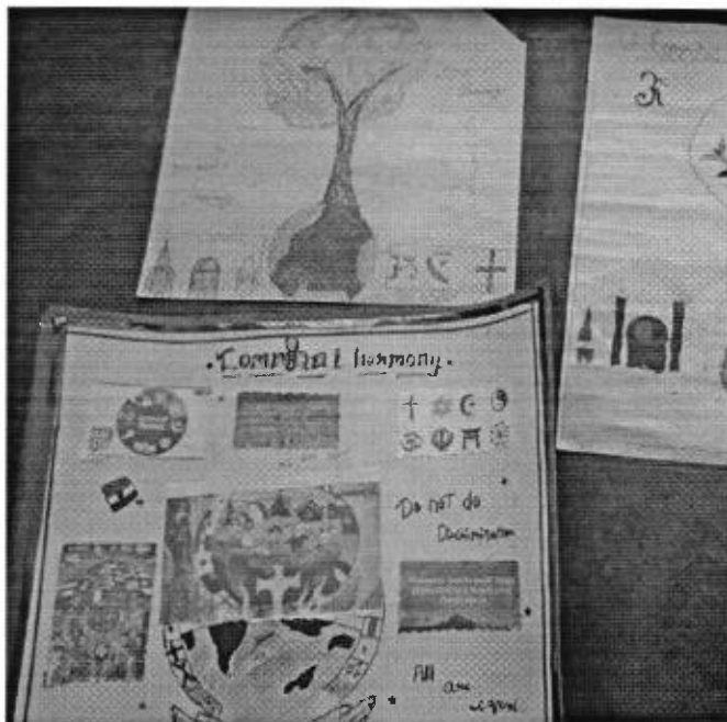
Posters Making Competition during Outreach Campaign to promote National Integration and Communal Harmony